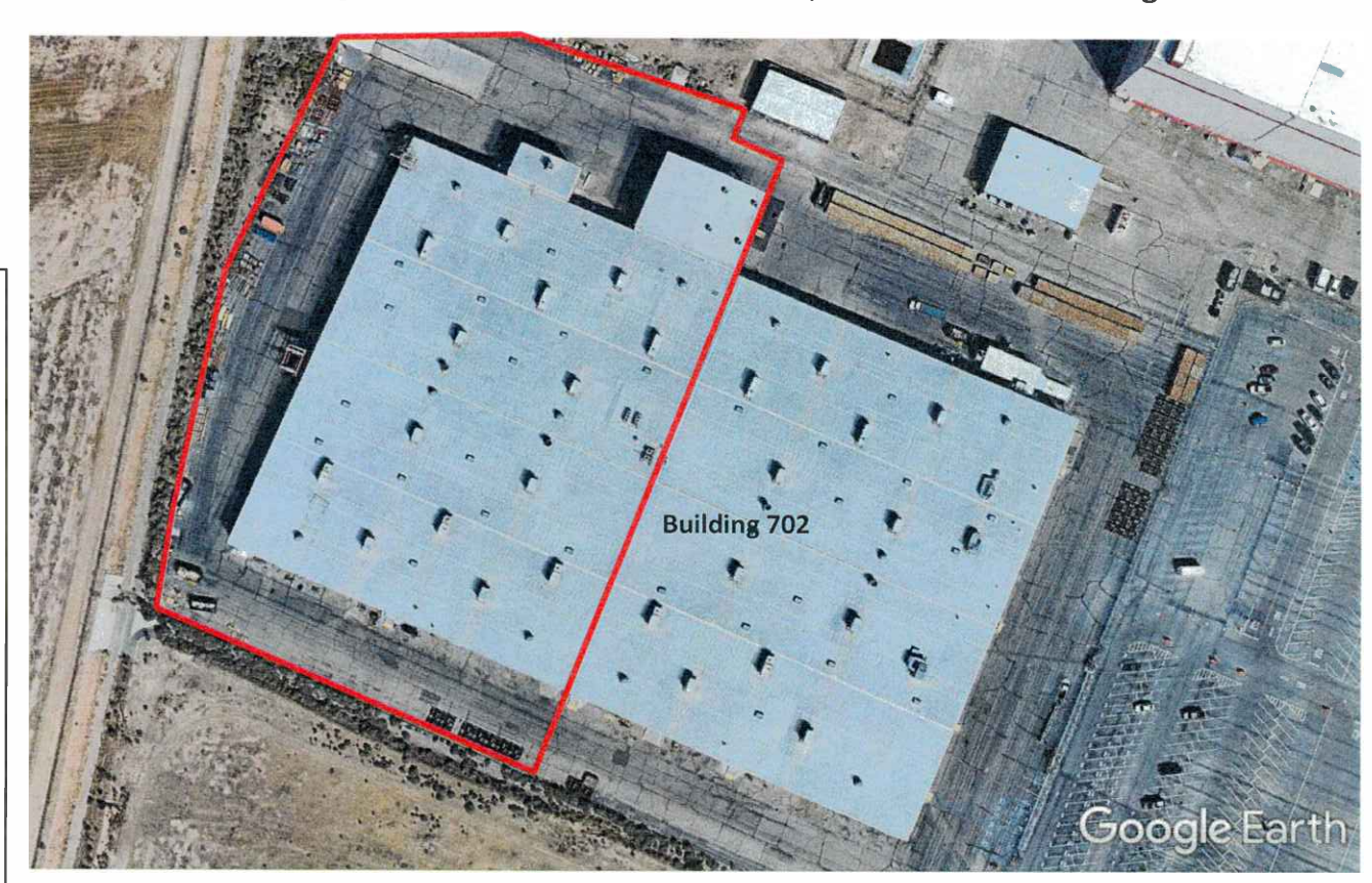
Exhibit A2 (Page 3 of 3)